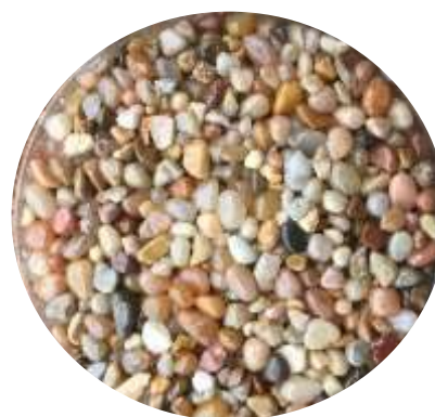
Coral – Small