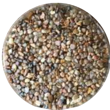
Ozark Brown -Small